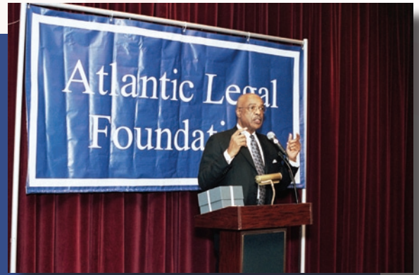
Secretary Paige explained: "We have already passed this hurdle about whether or not there will be charter schools. That argument is settled...they're here to stay."